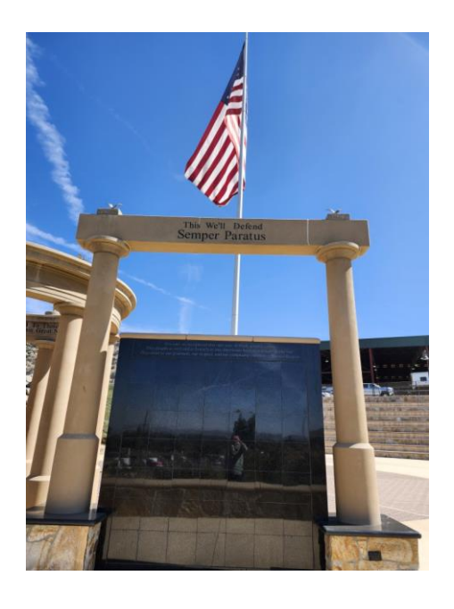
Marine Corp motto: "always faithful"