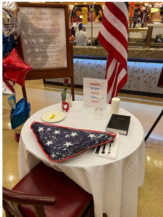
Missing Man/Fallen Soldier table