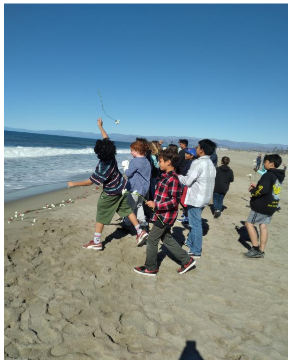
The flower toss into the surf