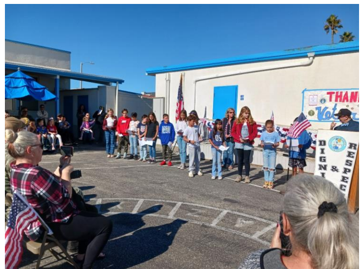
“10 Reasons to Appreciate Veterans” presented by 6 th grade class of Pelicans