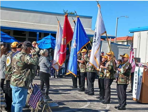
VVVC Members present colors during Pledge of Allegiance and National Anthem