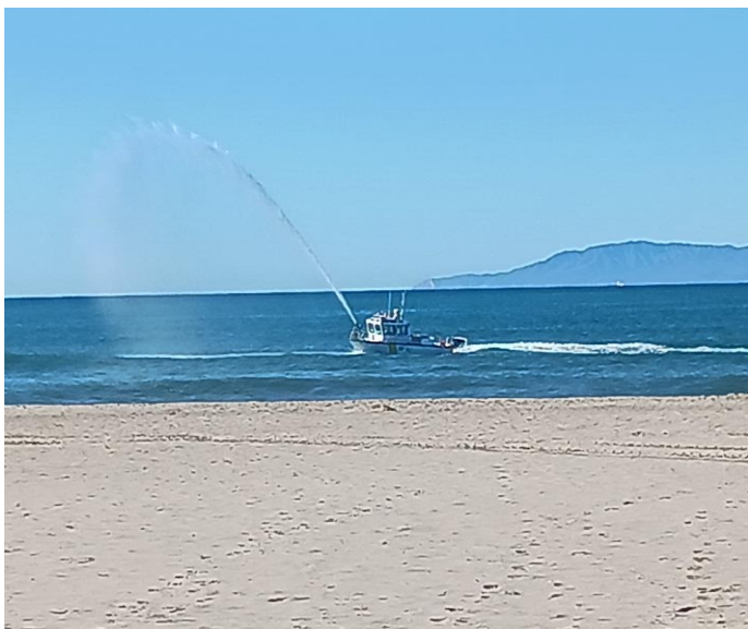
Delivery of Wreath of Flowers to Ocean for Fallen Heroes by U.S. Naval Boat