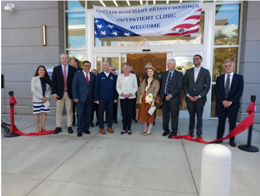
Ribbon-cutting ceremony for the opening of the clinic