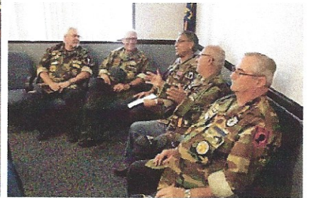
2019 Ventura County Stand-Down