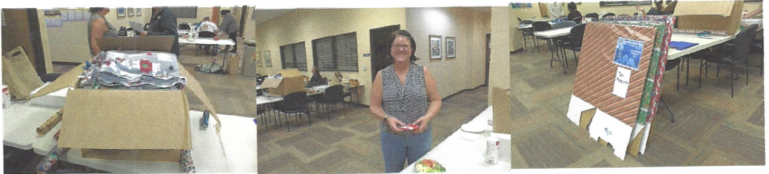
Operation Snowflake no-sew blankets and gift box work party