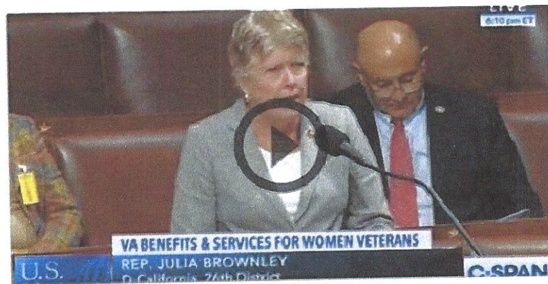
Congresswoman Brownley delivers remarks on the Floor of the U.S. House of Representatives on the Deborah Sampson Act.

the Deborah Sampson Act passed the U.S. House of Representatives with a vote of 399 to 11.