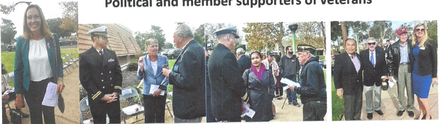
Political and member supporters of veterans