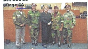
At a ceremony, the county's Veterans Court was renamed for now-retired Judge Colleen Toy White.