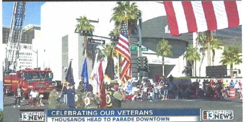
Las Vegas Veterans Day Parade VVVC Color Guard