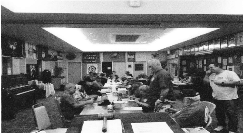
A 'Full House' at our November meeting!

Further nominations will be accepted at the December meeting.